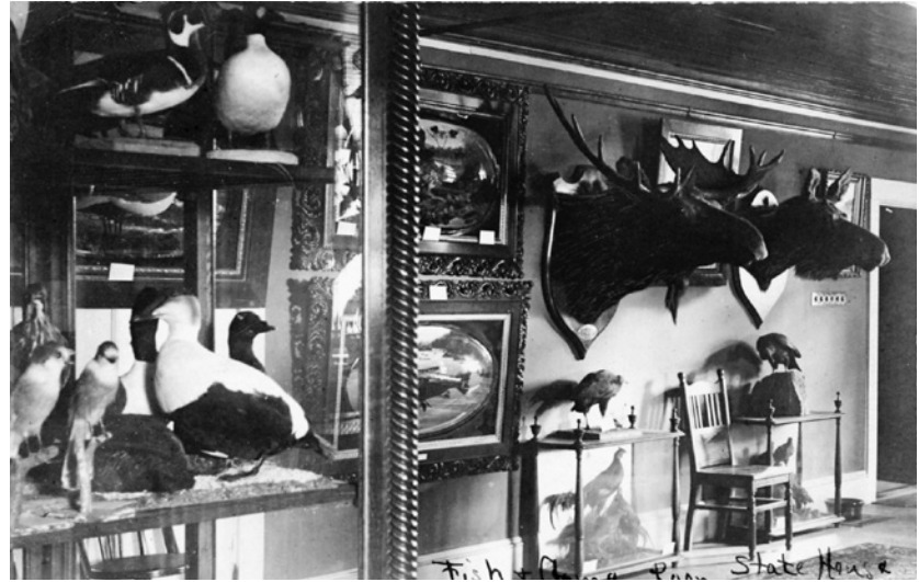
Some of the Maine State Museum displays in 1904, when the museum was part of the Maine Commission of Inland Fisheries and Game and was housed in the basement of the State House. From a photo postcard courtesy of the Maine Historic Preservation Commission.

of wanting to keep up with the new cultural waves spreading out from Washington, but it was mainly about being proud of Maine. Maine citizens were deeply proud of their state and some part of their own personal identity and value was connected with to it. It was a version of state nationalism, and we have certainly all seen the powerful effects of nationalism when applied to countries and ethnicities. It is at work at the state level too, in ways we hope are benign and constructive, encouraging education and knowledge primarily. Woe to any who might imagine that the Maine State Museum is a merely decorative ornament of state government: when people have brought such an institution back from the brink again and again over a span of close to two centuries, they are surely voting with their hearts. 🐟