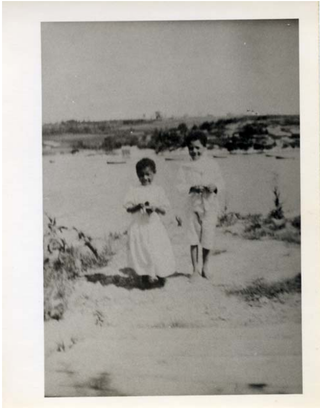
Unidentified boy and girl on Malaga Island, circa 1910