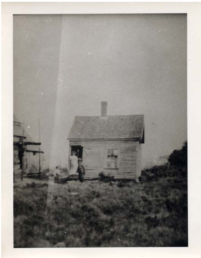
Eason house, Malaga Island, circa 1908