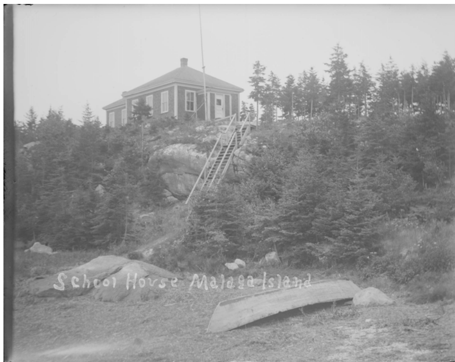
Malaga Island school, 1911

Maine State Museum collection, 96.38.189