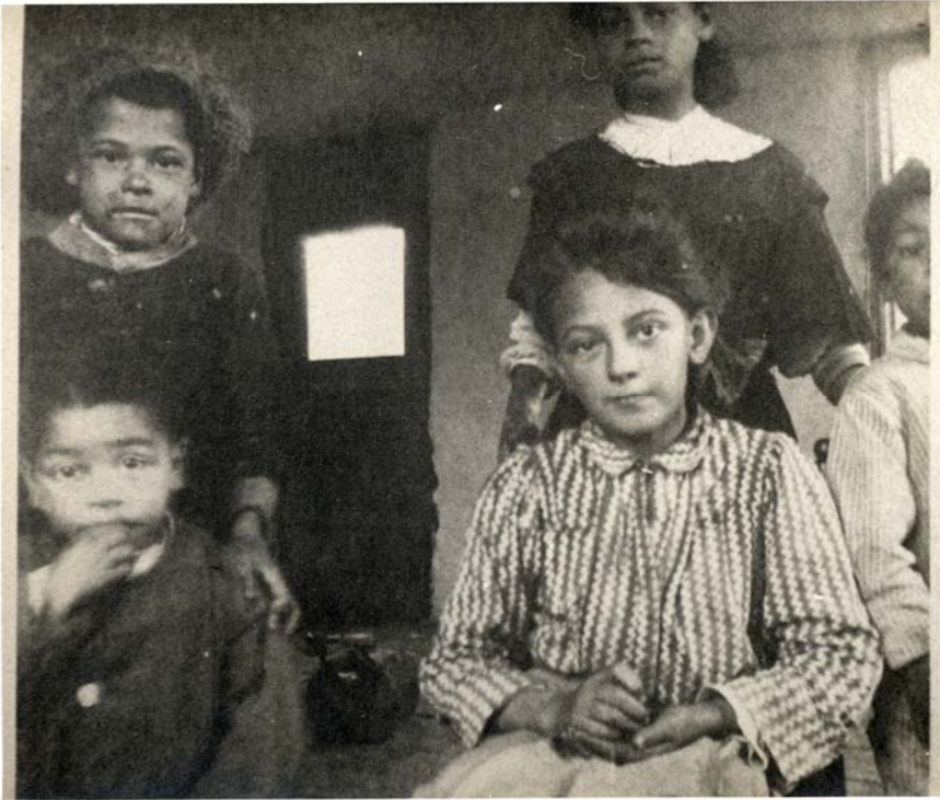
Unidentified children inside a home on Malaga Island, circa 1910