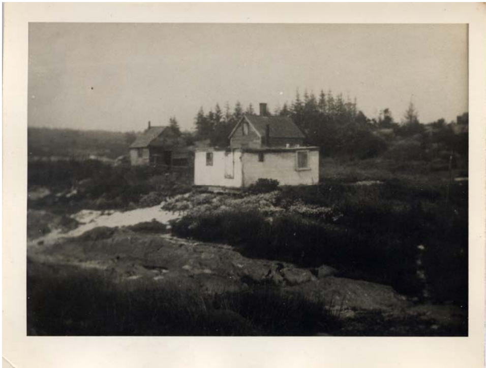
Eliza Griffin house, Malaga Island, circa 1908