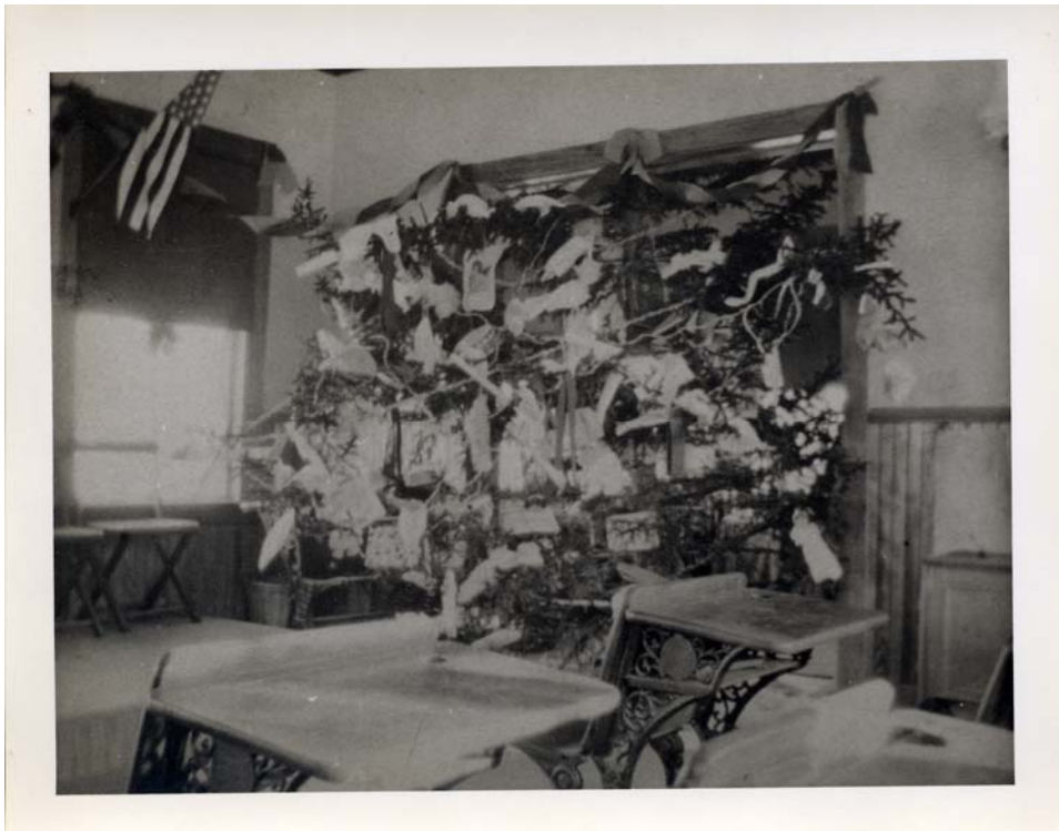
Interior of the Malaga Island school decorated for Christmas, circa 1910