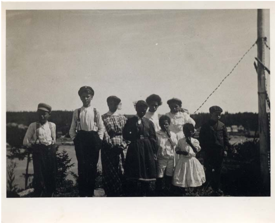
Group of Malaga Island students, circa 1910