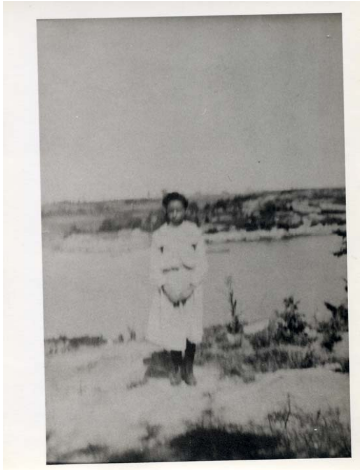
Unidentified girl on Malaga Island, circa 1910