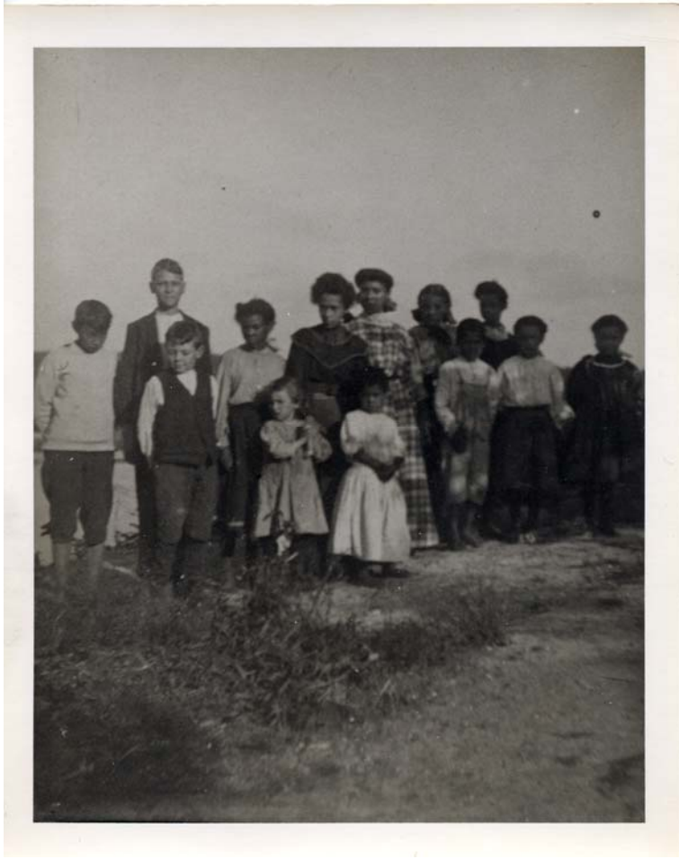
Group of Malaga Island students outside, circa 1910