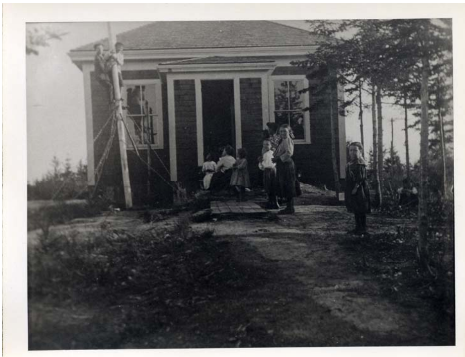
Students entering the Malaga Island school, circa 1910