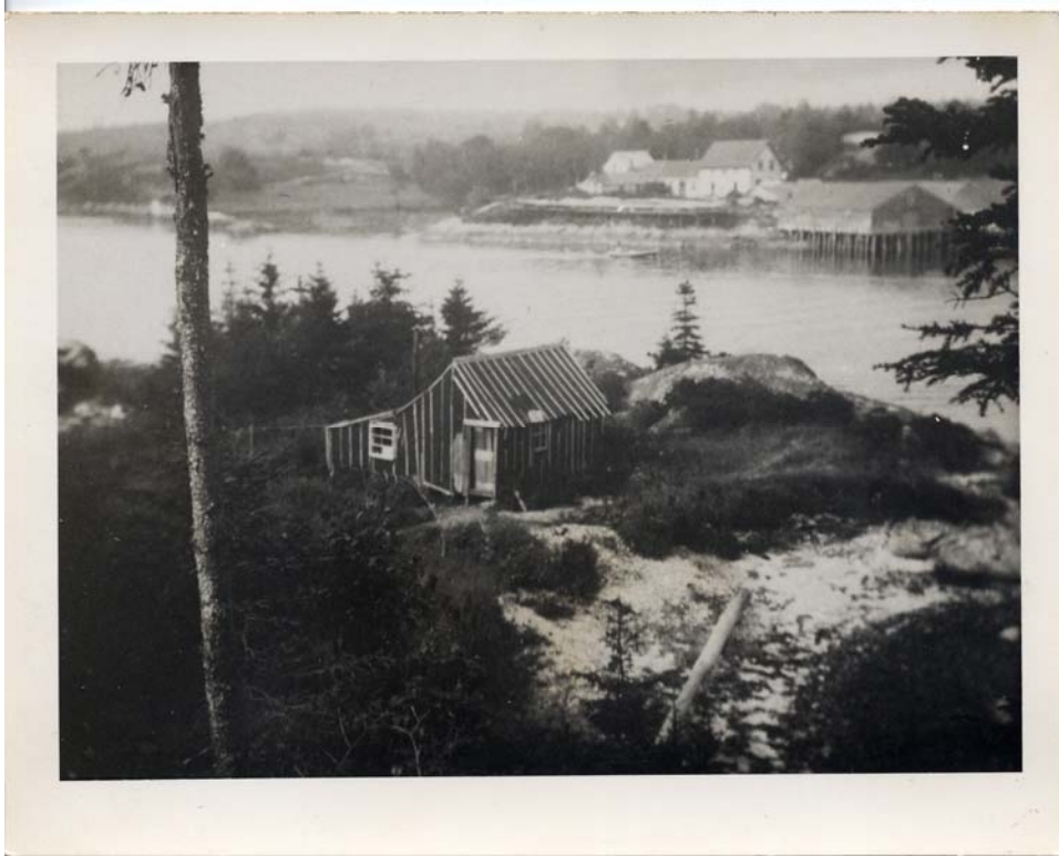
View from a tarpaper house on Malaga Island looking toward the Phippsburg mainland, circa 1910