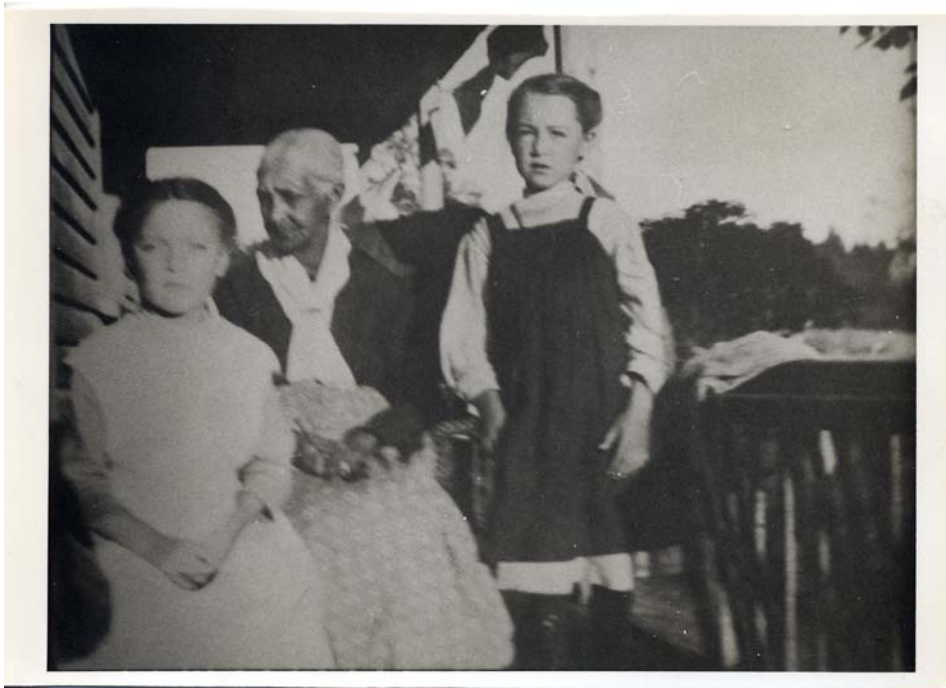
Unidentified woman with children on Malaga Island, circa 1910