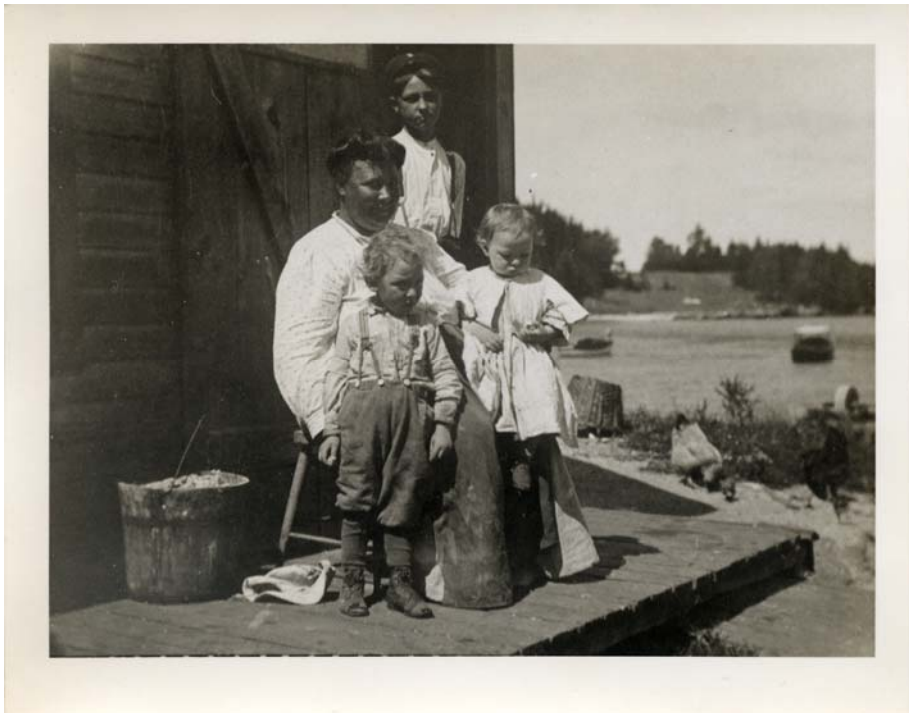
Murphy family, Malaga Island, circa 1910