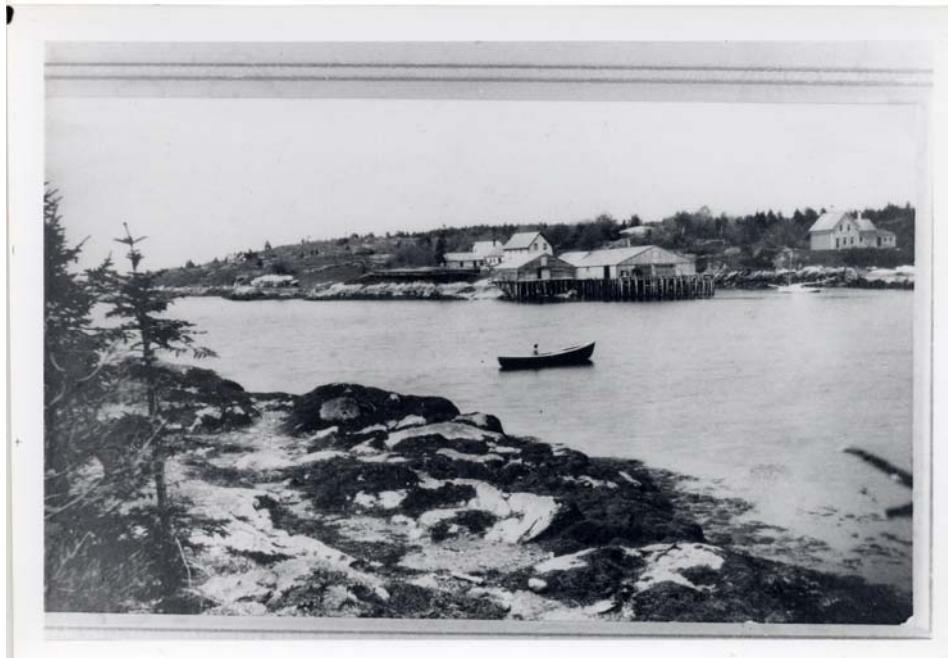
Eastern shore of Malaga Island looking towards the Phippsburg mainland, circa 1910