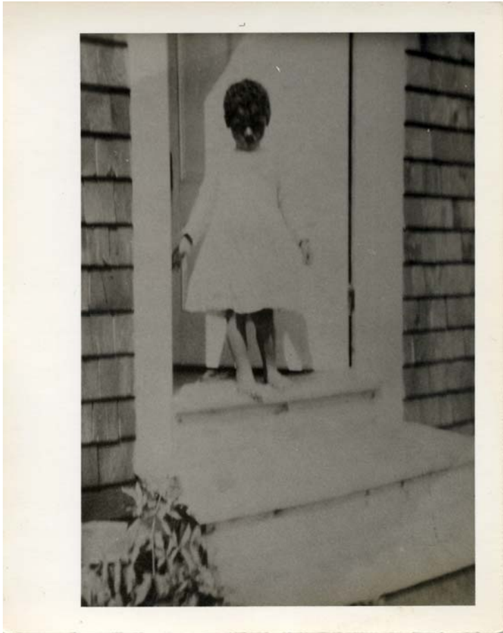
Unidentified young girl on Malaga Island, circa 1910