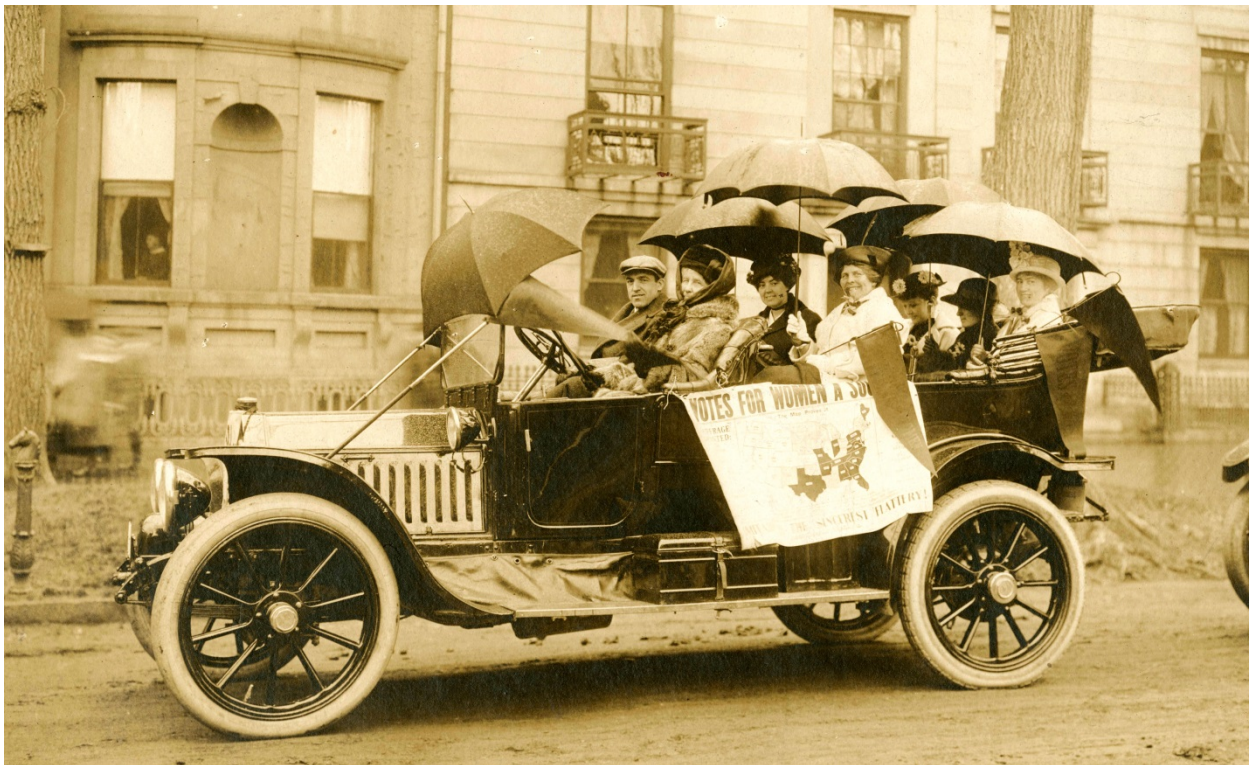
Suffragists in a Portland Parade, 1914. Do you see the map on the side of the car?

The maps also showed a political threat to eastern states. A state like California had twice as many voters because both men and women had suffrage. If western states had more voters, they would have more political power. This was especially important in presidential elections. Suffragists said that eastern states should give women voting rights to protect their power.